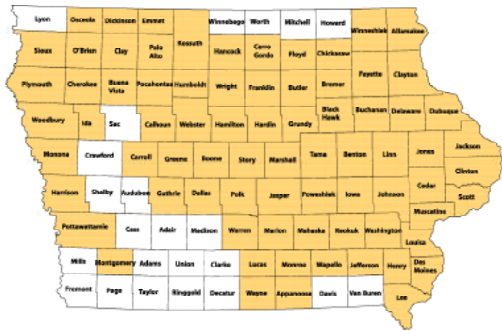
■ = Iowa counties where Iowa Student Loan nursing or teacher loan forgiveness recipients have worked (through Dec. 15, 2008).

Here is a look at some of each loan forgiveness program's positive outcomes to date.